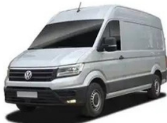
T5 Years 2007-2014