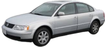
PASSAT B5 Years 1998-2000