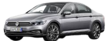
PASSAT Years 2000-2001 2006-2014