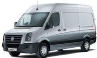
CRAFTER 2E/2F Years 2006-2014