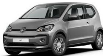
UP! Years 2008-2014