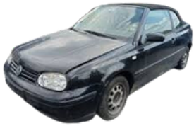
GOLF CABRIOLET Years 1998-2001