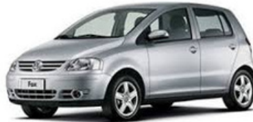
FOX Years 2006-2014