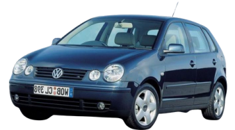
POLO Years 2006-2014