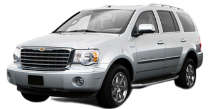
ASPEN Années 2007-2009