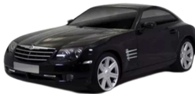
CROSSFIRE Années 2007-2008