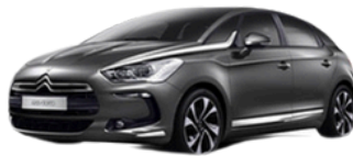
Citröen DS4 Années 2010-2017