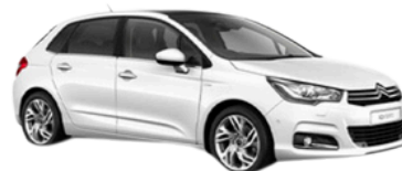
Citröen C4 Années 2010-2017