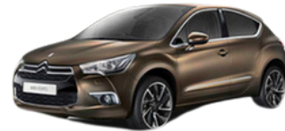
Citröen DS4 Années 2010-2017