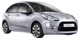
Citröen C3 Années 2010-2017