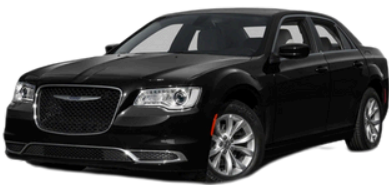
300 Années 2004-2016

Your safety is our top-ranked priority STOP DRIVE & FREE REPAIRS