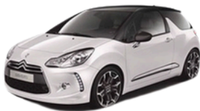
Citröen DS3 Années 2010-2017