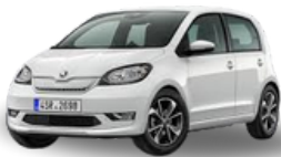
CITIGO (NF) 2013-2018