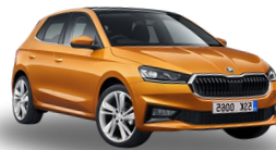
FABIA III (NJ) 2015-2018