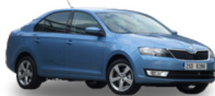
RAPID EU (NH) 2013-2018