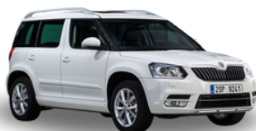
YETI (5L) 2014-2017