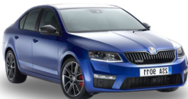
OCTAVIA III (5e) 2013-2018