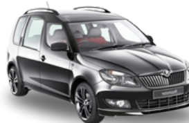
ROOMSTER (5J) 2013-2015