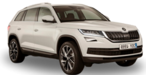
KODIAQ EU (NS) 2017-2018