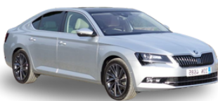
SUPERB III (3V) 2015-2018