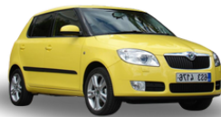
FABIA II (54) 2013-2018