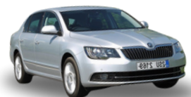
SUPERB II (3T) 2014-2015