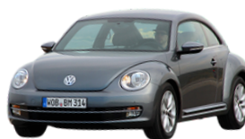
BEETLE / COCCINELLE