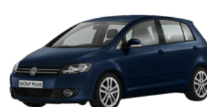
GOLF/ GOLF PLUS