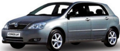
COROLLA Année 2004-2013