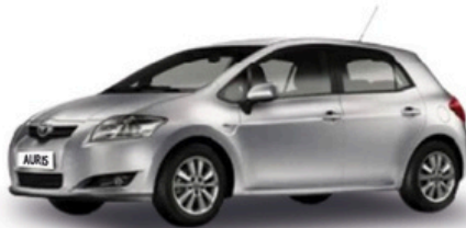
AURIS Année 2007-2010