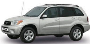
RAV 4 Année 2003-2005

Your safety is our top-ranked priority STOP DRIVE & FREE REPAIRS