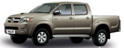
HILUX Année 2005-2011