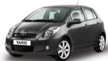
YARIS Année 2005-2011