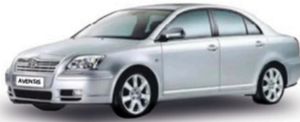
AVENSIS Année 2003-2008